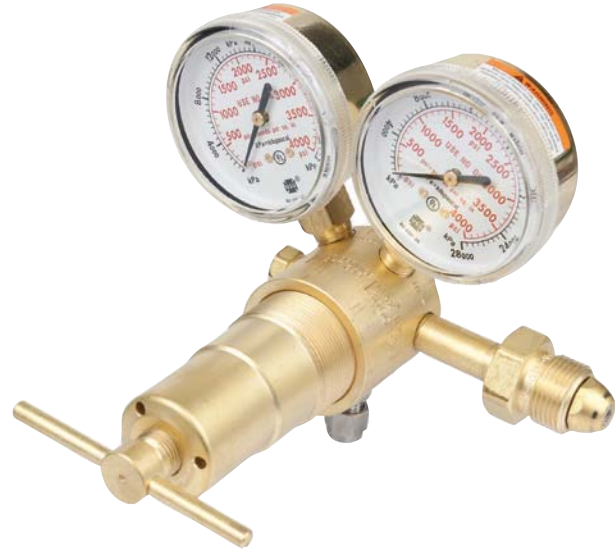
SR 4 FLOW DATA